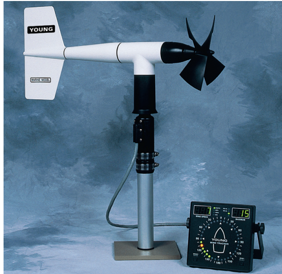
Wind Tracker pictured with Wind Monitor – MA

The Marine Wind Tracker is very compact. Face size is 144 mm x 144 mm to fit standard DIN panel configurations. Depth is 36 mm for easy mounting on vertical bulkheads or wall surfaces. 12-30 VDC input power enables the Wind Tracker to be powered by ship's batteries. A universal mounting bracket and AC wall adapter are included. Model 06260 Protective enclosure offers extra protection for wet or dusty locations.